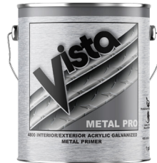
4800 Metal Pro Primer Int./Ext.