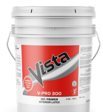
301 V-PRO 300 Primer Int.

To view our extensive list of products, visit: www.vistapaint.com/products