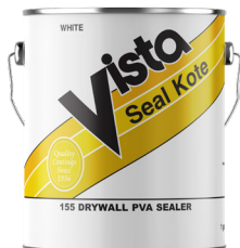
155 Seal Kote PVA Sealer Int.