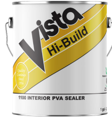
1100 Hi-Build PVA Sealer Int.