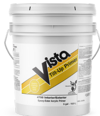
4700 Tilt-Up Primer Int./Ext.