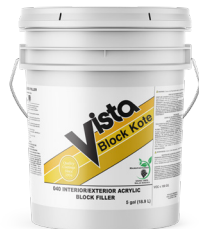
040 Block Kote Block Filler Int./Ext.