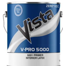
5001 V-PRO 5000 Primer Int.