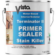
4200 Terminator II Int./Ext.