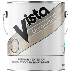
4600 Uniprime II Int./Ext.