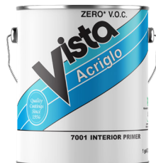
7001 Acriglo Primer Int.