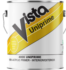
4000 Uniprime Multi-Purpose Primer Int./Ext.