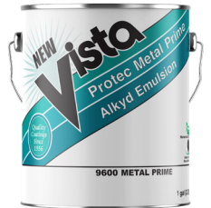
9600 Protec Metal Primer Int./Ext.