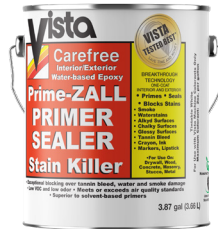
8000 Prime-ZALL Int./Ext.