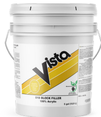
018 100% Acrylic Block Filler Int./Ext.