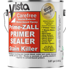
8000 Prime-ZALL * Int./Ext.