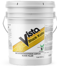
040 Block Kote Block Filler ** Int./Ext.