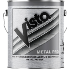
4800 Metal Pro Primer ** Int./Ext.