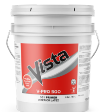
301 V-PRO 300 Primer Int.