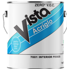
7001 Acriglo Primer Int.