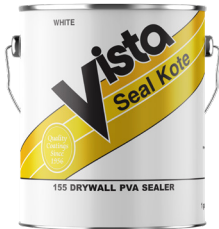
155 Seal Kote PVA Sealer Int.