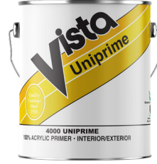
4000 Uniprime Multi-Purpose Primer ** Int./Ext.