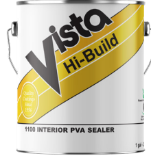
1100 Hi-Build PVA Sealer ** Int.