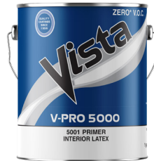
5001 V-PRO 5000 Primer Int.