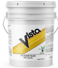
018 100% Acrylic Block Filler Int./Ext.