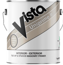
4600 Uniprime II ** Int./Ext.