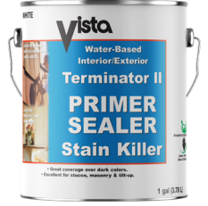
4200 Terminator II * Int./Ext.