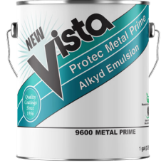
9600 Protec Metal Primer ** Int./Ext.