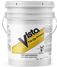
4700 Tilt-Up Primer Int./Ext.